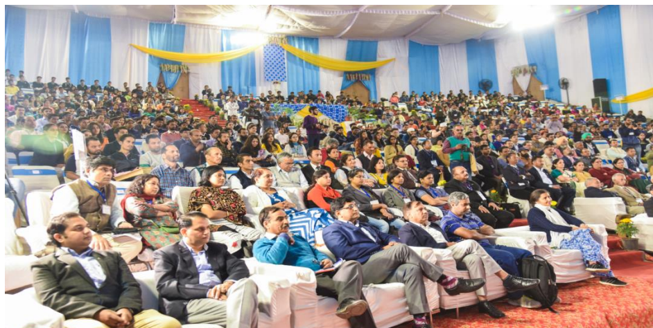
Audiences at the 3 rd Himachal Pradesh Science Congress

There were technical session and oral session in various disciplines such as Agriculture, Environmental Science, Forestry, Chemical and Physical Science, Nanotechnology, Engineering Technology. Over 300 abstracts, 105 visiting participants, over 35 exhibitors, 400 science teachers and students visited, panel discussions on the theme of rural upliftment through science and technology intervention. A large number of students from various institutes of Himachal Pradesh, Jammu and Kashmir, Uttarakhand, Punjab, Chandigarh participated in the technical session. Award has been given to best oral and poster presenters from all the disciplines.