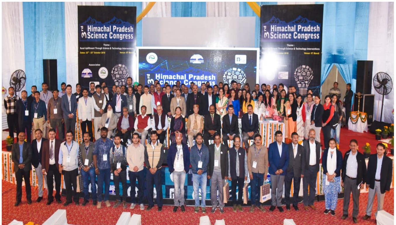
Dignitaries and participants of 3 rd Himachal Pradesh Science Congress at IIT Mandi