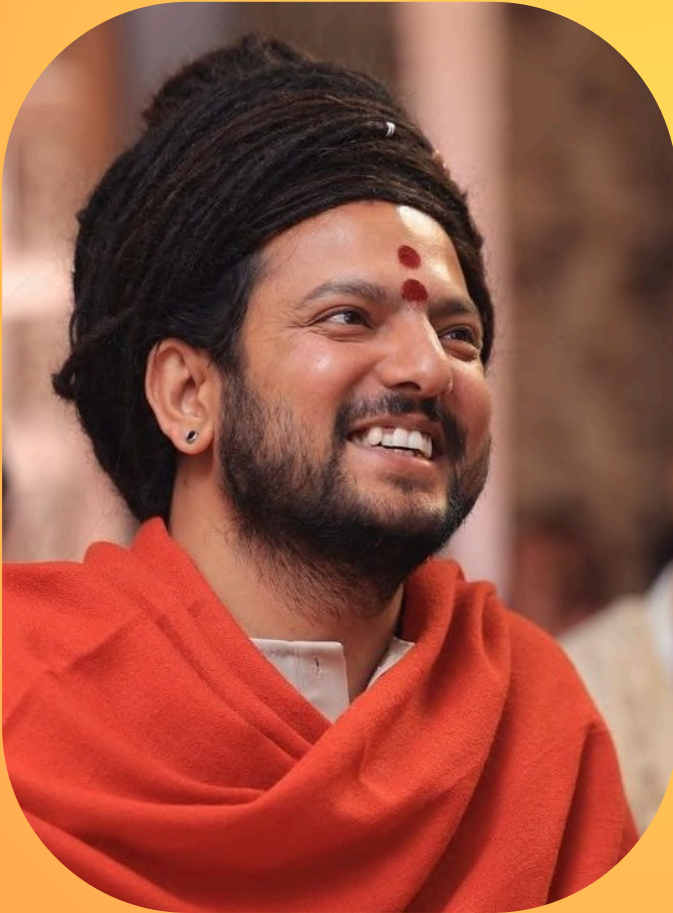
Shri. Babaji Shivananda